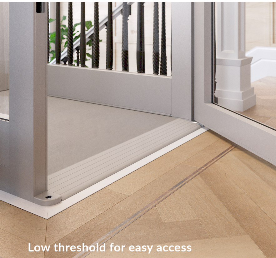
Low threshold for easy access